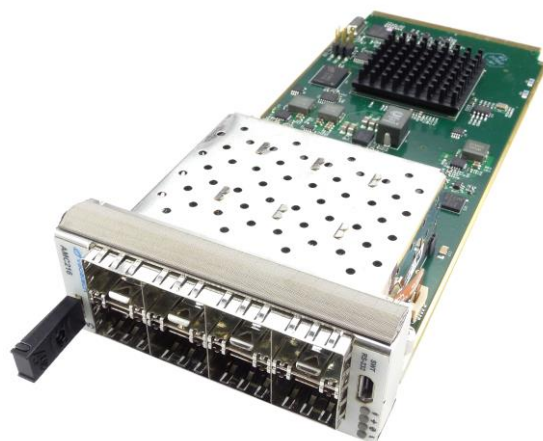
Figure 1: AMC216

The switch is managed via http and supports a rich set of features such as VLAN, Spanning tree, QoS, Mirroring, etc.