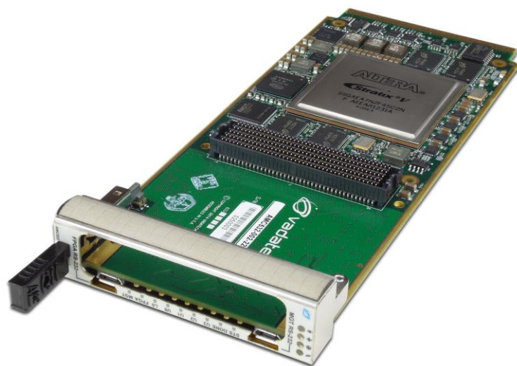
Figure 1: AMC532

See Intel FPGA Solutions for the advantages of using VadaTech products during application development.