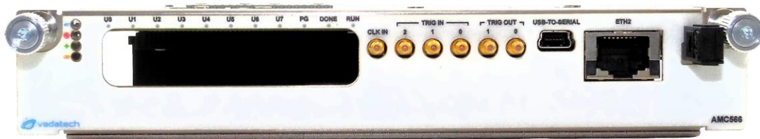
Figure 4: AMC566 Front Panel View