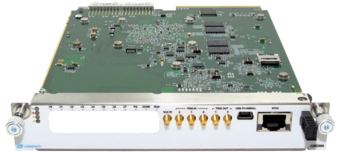
Figure 1: AMC566

The Module has 64 GB of Flash, 128 MB of boot flash, and an SD Card as an option. In addition, the module has three inputs and two outputs via SSMC connector.