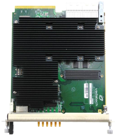
Figure 2: AMC566 Bottom View

*Some of the pins do not follow exactly to the D1.4 (OUT0+/-, OUT1+/-, OUT2+/- are LVDS and can be configured as input/out by FPGA).