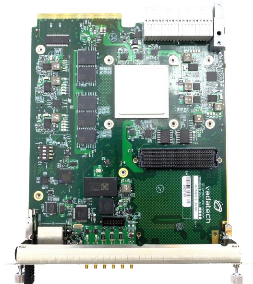
Figure 3: AMC566 Bottom View, no Heatsink