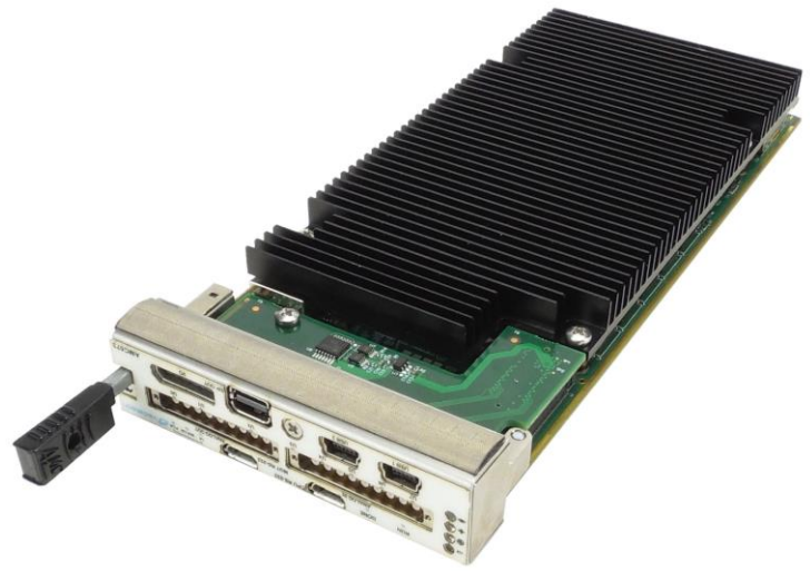
Figure 1: AMC573

The Module has onboard 64 GB of Flash, 128 MB of boot flash and an SD Card as an option.