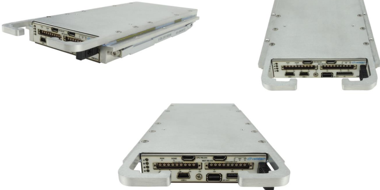
Figure 2: AMC573 Conduction Cooled