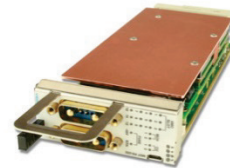
UTC020 1000W DC Power Module