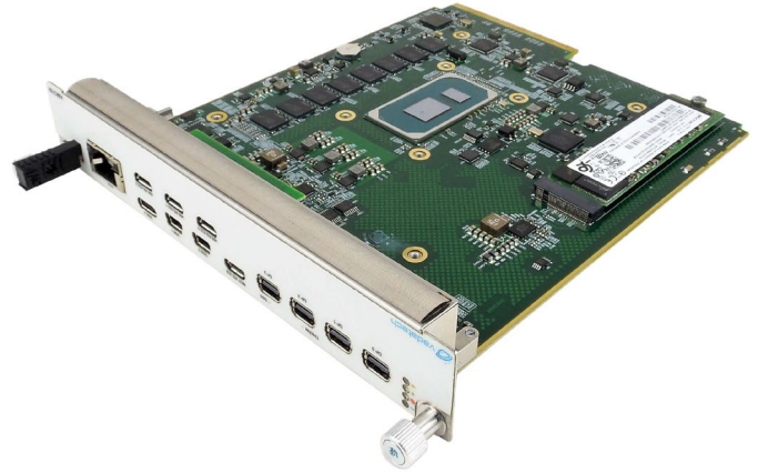
Figure 1: AMC768

The AMC768 provides 32 GB of DDR4 memory with in-band ECC. The module has Serial over LAN (SoL) capabilities. The BIOS allows booting from on-board M.2, off-board SATA, PXE boot and USB. Linux OS is standard on the AMC768, consult VadaTech for other options.