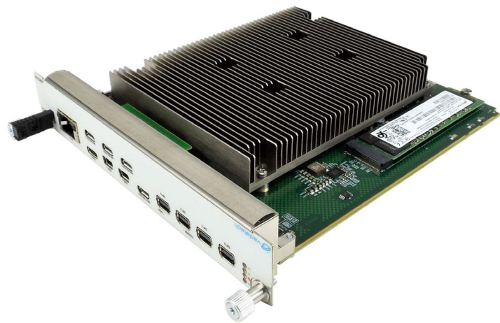
Figure 2: AMC768 w/ heatsink