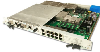
ATC806 40G/10G Switch w/Dual AMCs