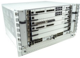
VT830 6U ATCA SlotSaver Chassis