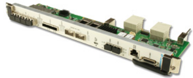
ART132 ATCA RTM