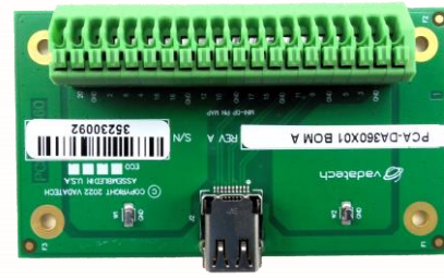
Figure 1: DA360 Top View