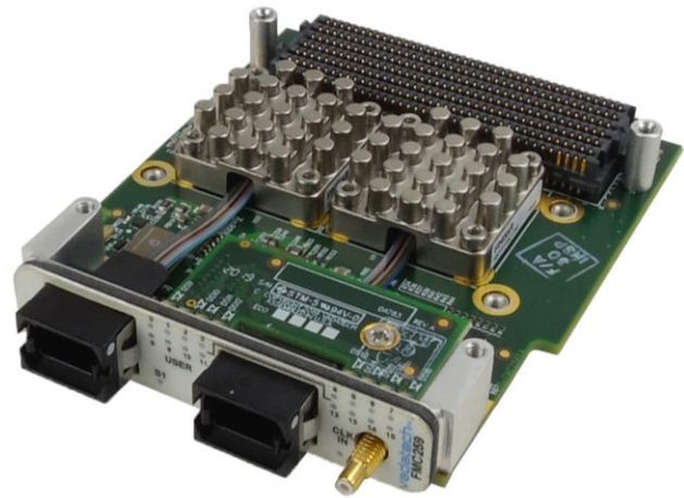
Figure 1: FMC259

The Module has LEDs in Green/Yellow to allow for LNK/ACT, debugging or as defined by user.