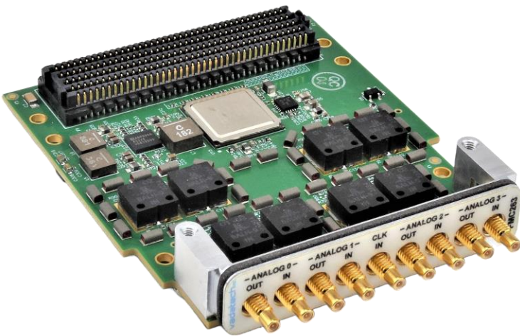
Figure 2: FMC263 without Heatsink