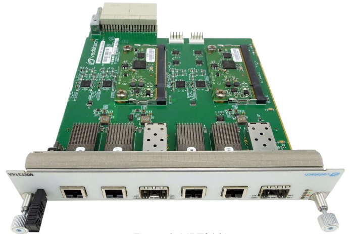
Figure 1: MRT314A

VadaTech offers a wide range of MicroTCA.4 products, including full systems. Contact your local salesperson or representative for details.