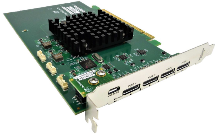
Figure 1: PCI126

The PCI126 mates to the host via PCIe x16 and have four x4 OCuLink connector for external devices (downstream devices). The Quad x4 could be configured as four distinct x4 connection or dual x8.