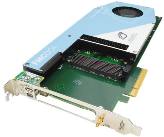
Figure 1: PCI592

PCI592 provides active cooling of the FPGA and FMC+ (the module does not support HSPCe connector) making it appropriate for power-hungry applications or those requiring temperature stability for good performance.