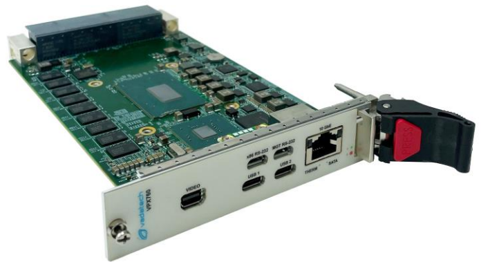
Figure 1: VPX760

The unit is available in a range of temperature and shock/vib specifications per ANSI/VITA 47, up to V3 and OS2.