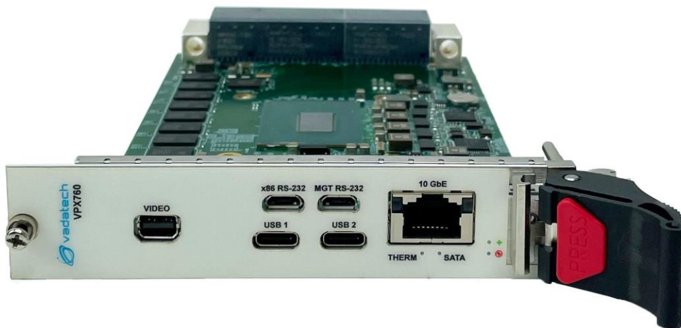
Figure 3: VPX760 Front Panel