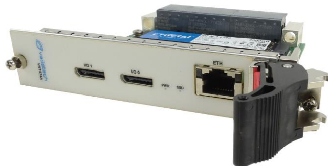
Figure 1: VRT574A

Two OcuLink high speed I/O connectors support general purpose and serial interfaces routed from RP1, one for LVDS lanes [0:7] and one for M-LVDS lanes [8:15]. This section of the board can be customized for specific customer requirements, contact VadaTech sales for details.