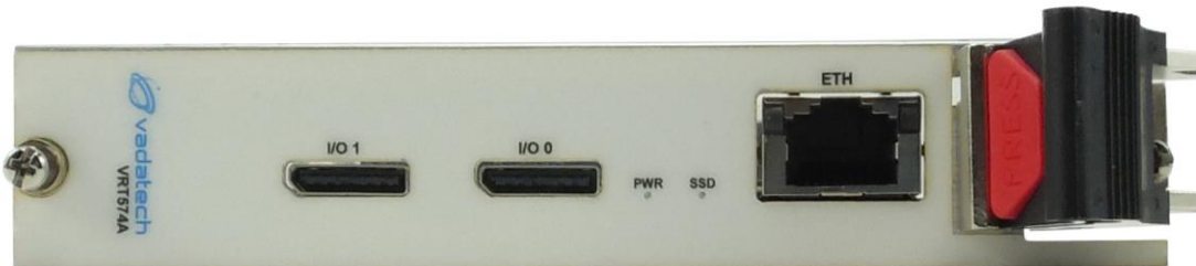
Figure 3: VRT574A Back Panel