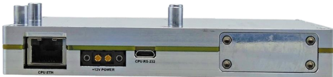
Figure 3: VT560 Rear I/O