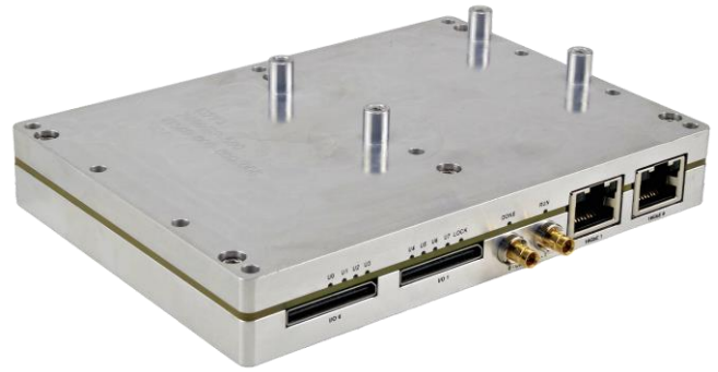
Figure 1: VT560

The VT560 further provides 17 LVDS input/outputs, 2x RS-485, 8x +5V GPIO and high speed SERDES pair (RX+/- and TX+/- XOR). Each of the single-ended ports can be configured as input or output.