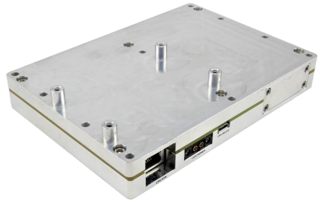
Figure 2: VT560 Rear View