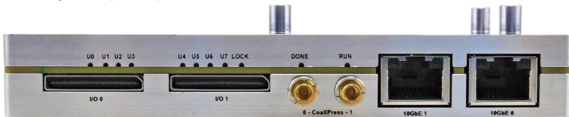
Figure 3: VT560 Front I/O