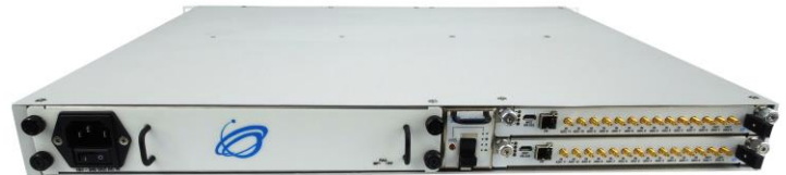
Figure 2: VT816 Rear View