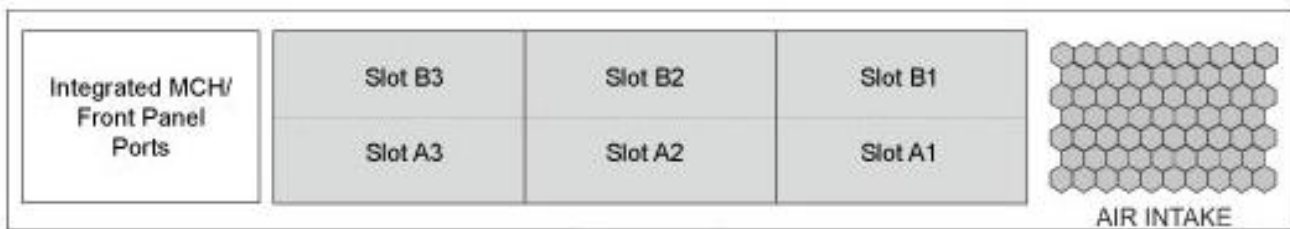
Figure 6: VT951 Front Panel