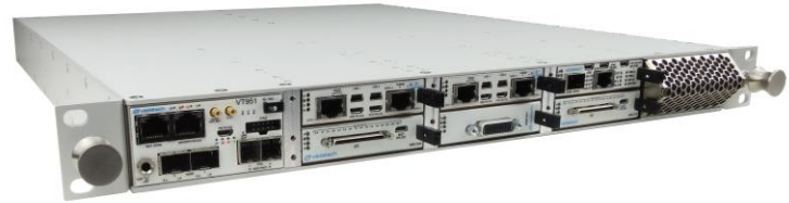
Figure 1: VT951 Chassis Front View

VadaTech's Scorpionware software can be used to access information about the current state of the Shelf or the Carrier, obtain information such as the FRU population, or monitor alarms, power management, current sensor values, and the overall health of the Shelf. The software GUI is very powerful, providing a Virtual Carrier and FRU construct for a simple, effective interface.