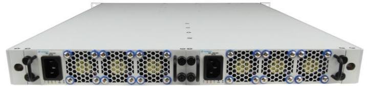
Figure 2: VT951 Chassis Rear View