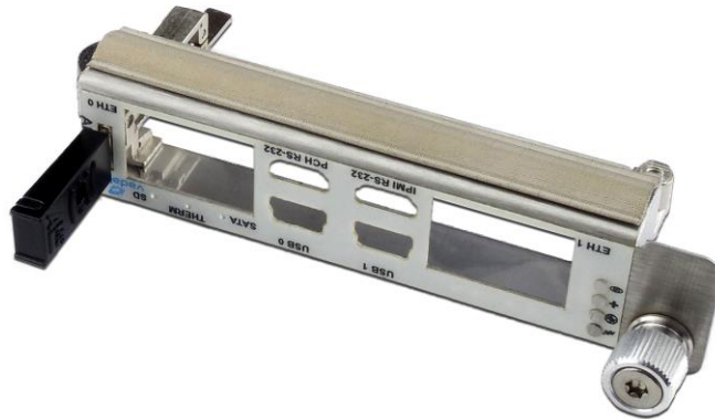
Figure 3: Single Latching Flange Panel (example)

The VadaTech SLF design is a space-saving solution for rugged environments and is compatible with the VT951. It provides one latching flange and screw on the opposite side of the standard AMC latching handle. This front panel solution provides improved retention strength and stability. MicroTCA.1 compliant AMCs have latching flanges on both sides of the board, providing up to 25g shock and 8g random vibration resistance. However, in horizontal-mount enclosures the dual flanges take up considerable space. The SLF design from VadaTech reduces the space utilized, allowing more performance density to be offered in specially-designed enclosures. The SLF solution's screw spacing is compatible with MicroTCA.1. Therefore, this design can be utilized in all of VadaTech's standard 3U to 5U horizontal-mount chassis that accept both MicroTCA.0 and MicroTCA.1 panels.