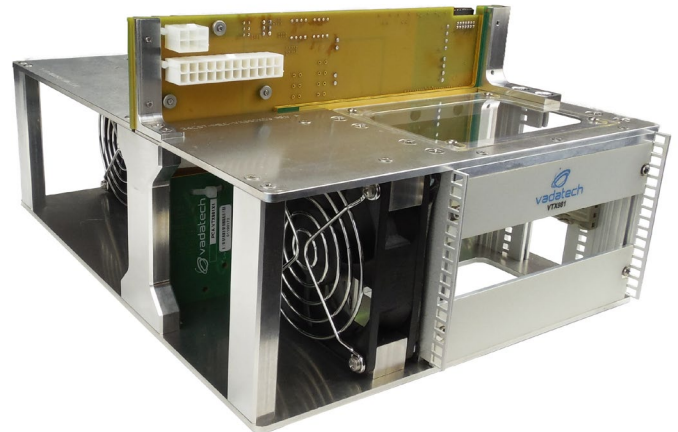
Figure 2: VTX981 Chassis Rear View