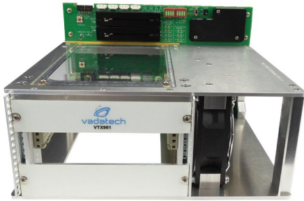
Figure 3: Chassis Layout – Front