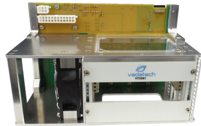
Figure 4: Chassis Layout – Rear