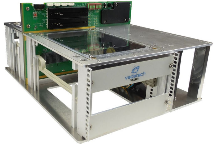
Figure 1: VTX981 Chassis Front View

The backplane breaks-out the JTAG signals via a header connector to enable external connection of a JTAG probe.