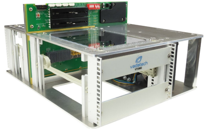
Figure 1: VTX982 Chassis Front View

The backplane breaks-out the JTAG signals via a header connector to enable external connection of a JTAG probe.