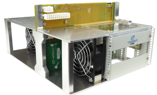
Figure 2: VTX982 Chassis Rear View