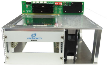
Figure 3: Chassis Layout - Front