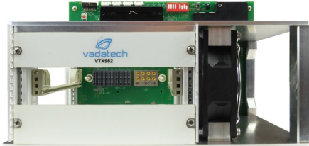
Figure 5: Chassis Layout – Front Vertical