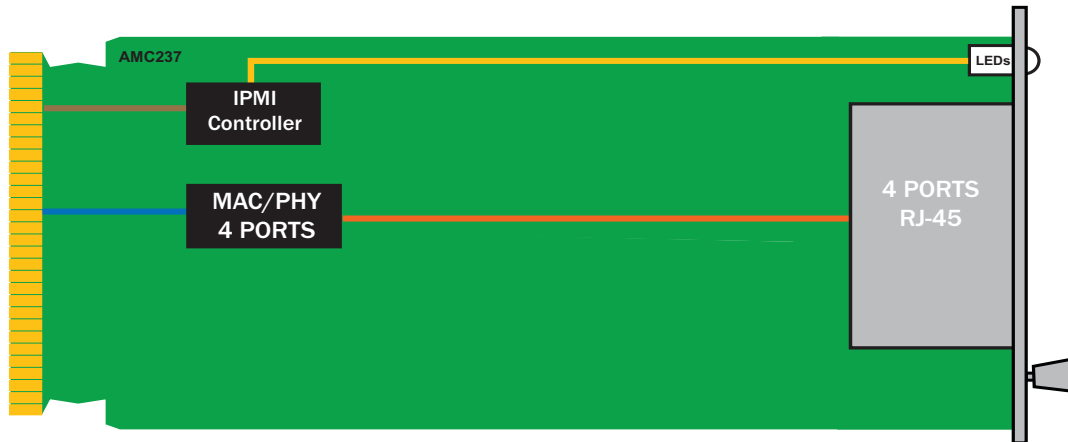
FIGURE 1. AMC237 Functional Block Diagram