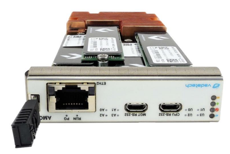
Figure 4: AMC613 Front Panel