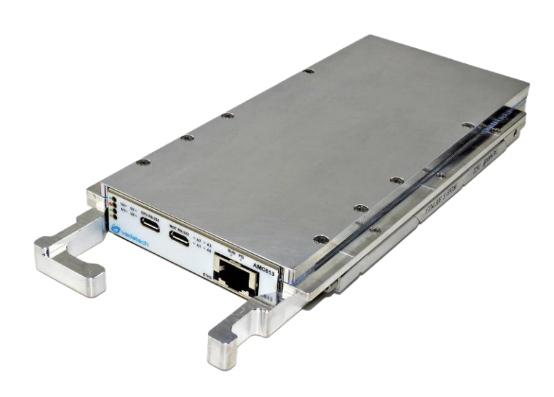
Figure 2: AMC613 Conduction Cooled