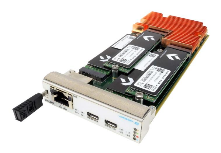
Figure 1: AMC613

The AMC613 is available in both air-cooled (MTCA.0 and MTCA.1) and rugged conduction-cooled versions (MTCA.2 or MTCA.3, contact sales for details).