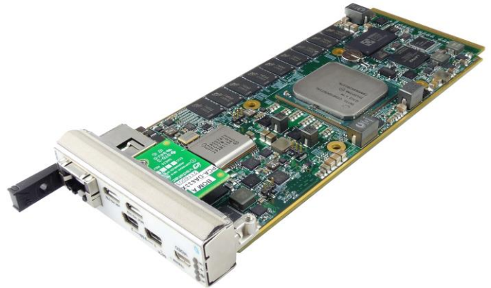
Figure 1: AMC754

See Solution Brief for an overview of a 56 GSPS digitizer with IRIGB/GPS timestamping.