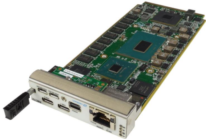
Figure 1: AMC761

Linux OS is standard on the AMC761, consult VadaTech for other options.