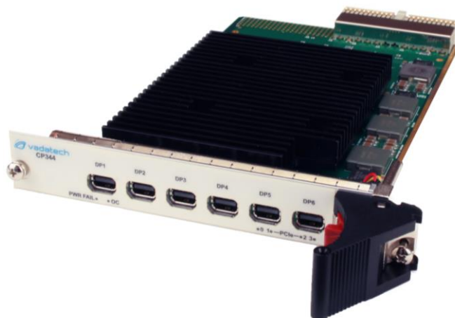
Figure 1: CP344

The CP344 features AMD's graphics processor chip (E6760) which enables dual HD decode of H.264, VC-1, MPEG4 and MPEG2 compressed video streams. The board offers up to 1 GB of GDDR5 memory and supports up to 6 independent displays with resolutions up to 3840x2400 @ 60 Hz, depending on number or ports used. The CP344 is PICMG 2.0 R 3.0 compliant and is available in the 3U size (a 6U panel is available). The CP344 board is not PCI +5 V signaling compatible.