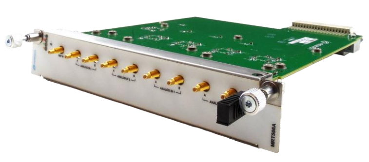
Figure 1: MRT566A

VadaTech offers a wide range of MicroTCA.4 products, including full systems. Contact your local salesperson or representative for details.