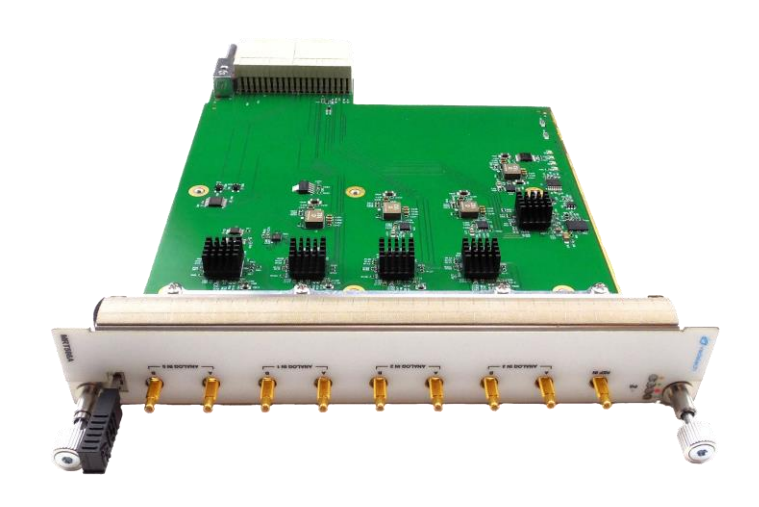
Figure 2: MRT566A Top View