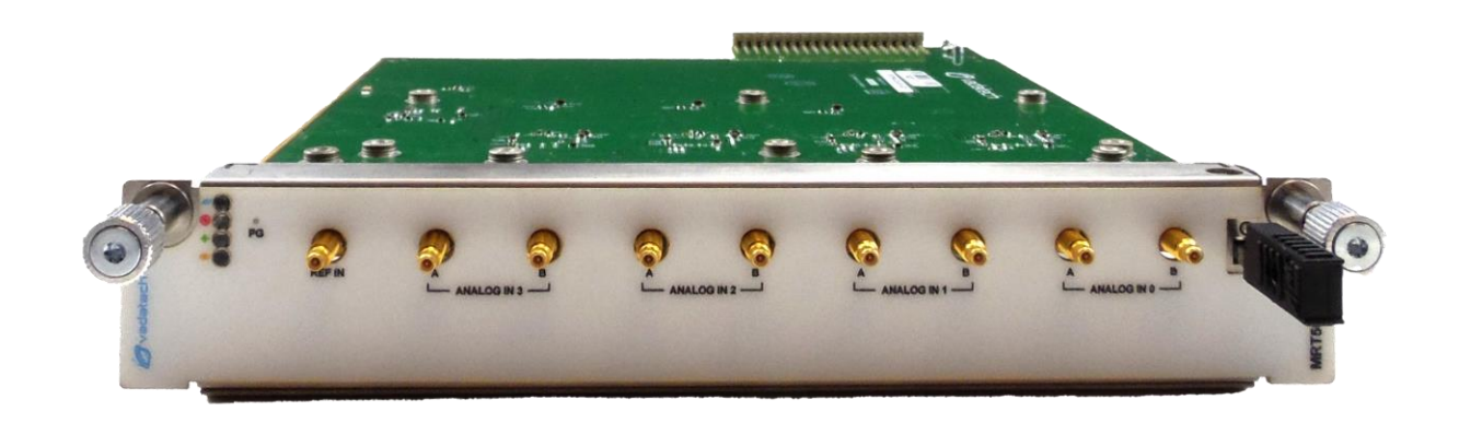
Figure 3: MRT566A Front Panel View (Flipped)