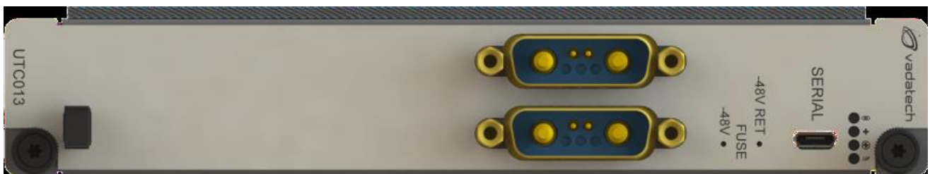
Figure 3: UTC013 Front Panel