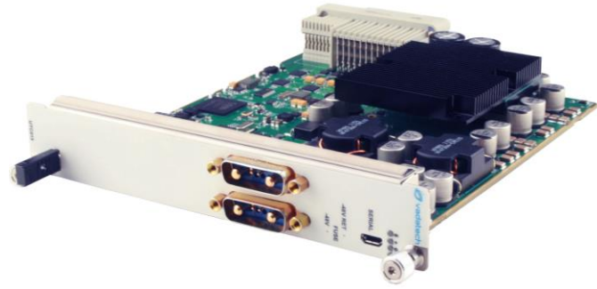
Figure 1: UTC013

The UTC013 is IPMI 2.0 and HPM.1 compliant with optional IPMI commands including warm/cold reset, re-arm sensor events, get device GUID, and get/set the hysteresis, threshold, and/or sensor event enable. The PMs follow the ATCA specification in fail-over for redundant IPMB-0 and FRU LED control. The units also have power channel control, get power channel status, PM reset, get PM status, and PM heartbeat. Temperature and current sensors are also included