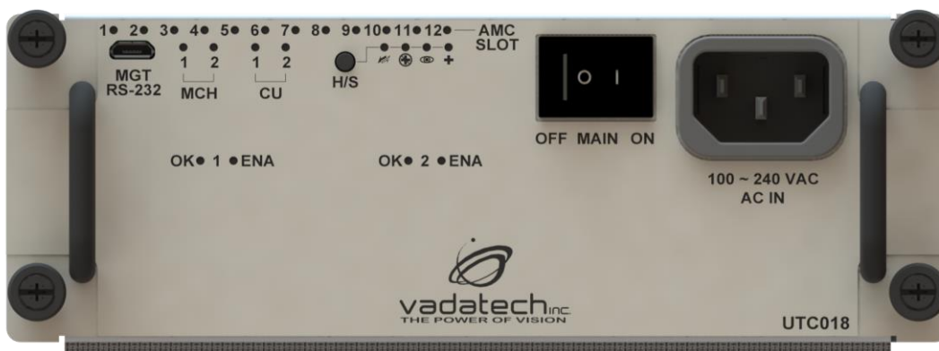
Figure 3: UTC018 Front Panel