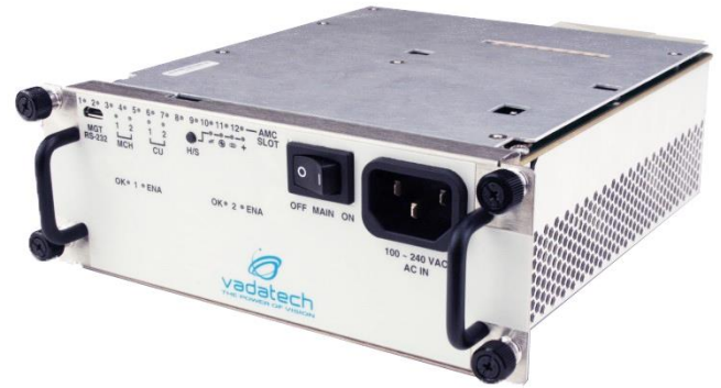
Figure 1: UTC018

The UTC018 is IPMI 2.0 and HPM.1 compliant with optional IPMI commands including warm/cold reset, re-arm sensor events, get device GUID, and get/set the hysteresis, threshold, and/or sensor event enable. The PMs follow the ATCA specification in fail-over for redundant IPMB-0 and FRU LED control. The units also have power channel control, get power channel status, PM reset, get PM status, and PM heartbeat. Temperature and current sensors are also included.