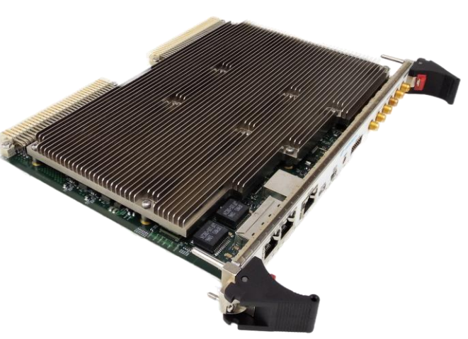
Figure 3: VME599 with Heatsink