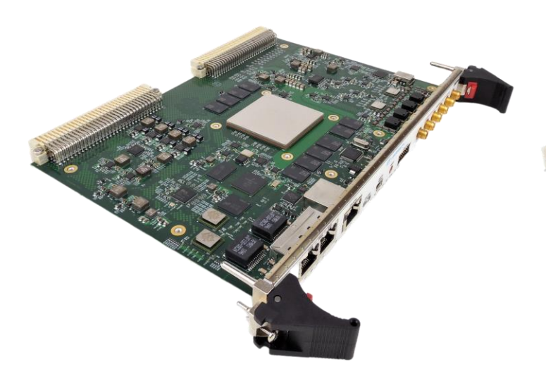
Figure 2: VME599 without Heatsink