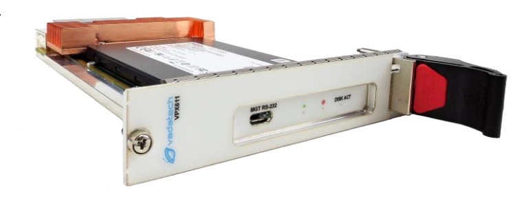
Figure 1: VPX611

The module supports one U.2 form factor NVMe storage device in 2.5" form factor. The module can accept a 15mm height disk with capacity of up to 30TB.