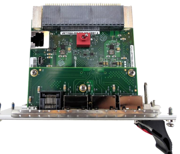
Figure 2: VRT769A Top View