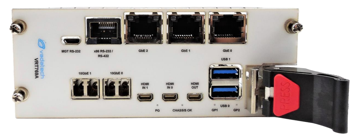
Figure 3: VRT769A Front Panel View