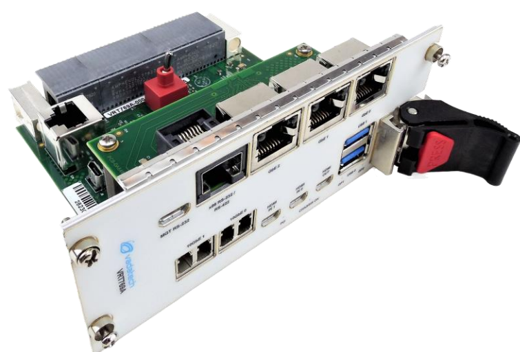
Figure 1: VRT769A