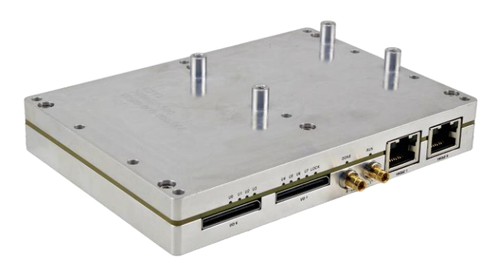
Figure 1: VT560

The VT560 further provides 17 LVDS input/outputs, 2x RS-485, 8x +5V GPIO and high speed SERDES pair (RX+/- and TX+/- XOR). Each of the single-ended ports can be configured as input or output.