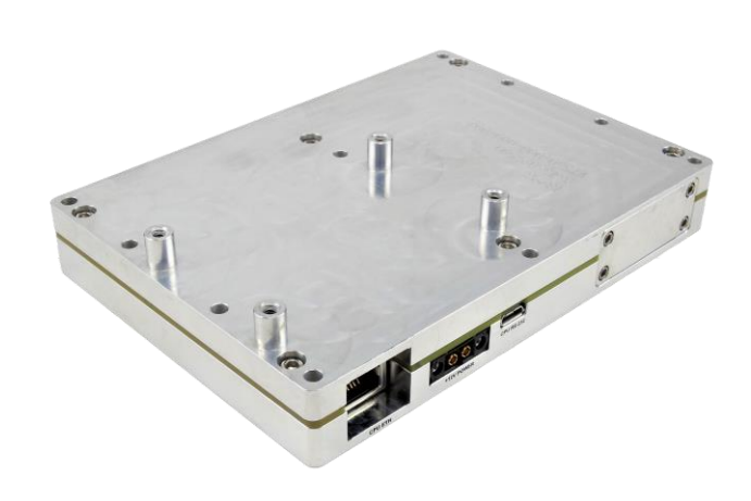
Figure 2: VT560 Rear View