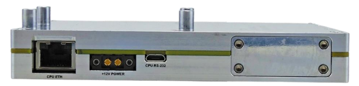
Figure 3: VT560 Rear I/O