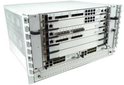
Figure 1: VT830

VadaTech's Scorpionware software can be used to access information about the current state of the Shelf or the Carrier, obtain information such as the FRU population, or monitor alarms, power management, current sensor values, and the overall health of the Shelf. The software GUI is very powerful, providing a Virtual Carrier and FRU construct for a simple, effective interface.