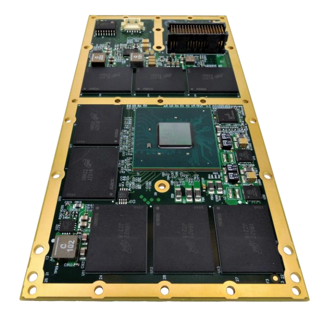
Figure 1: XMC645

The XMC645 has PCle x8 Gen4 to the host and PCle x4 Gen3 to each of the SSD modules. The module comes in conduction cool or convection cool.