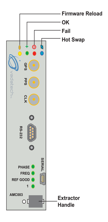
FIGURE 2. AMCOO3 Front Panel