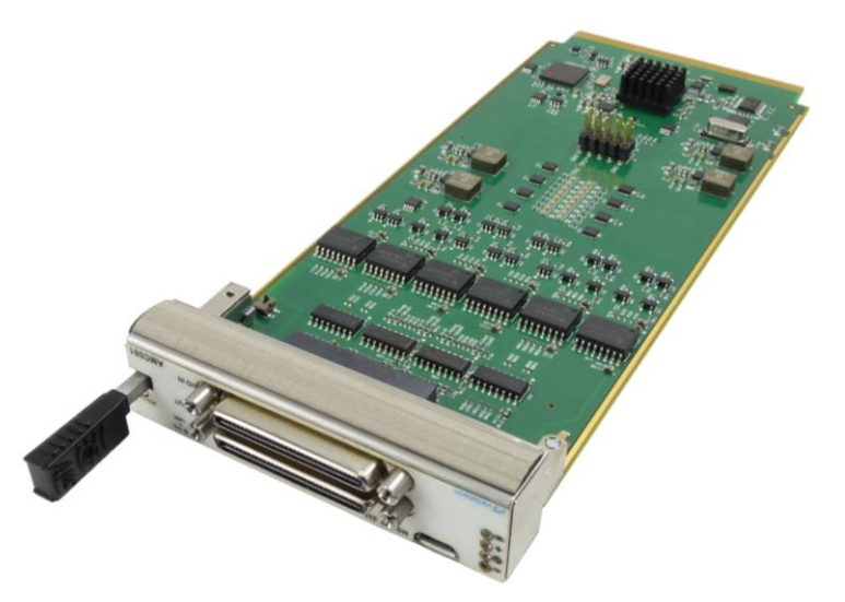
Figure 1: AMC081

The AMC081 is available in both air-cooled (MTCA.0 and MTCA.1) and rugged conduction-cooled versions (MTCA.2 or MTCA.3), please contact sales for details.