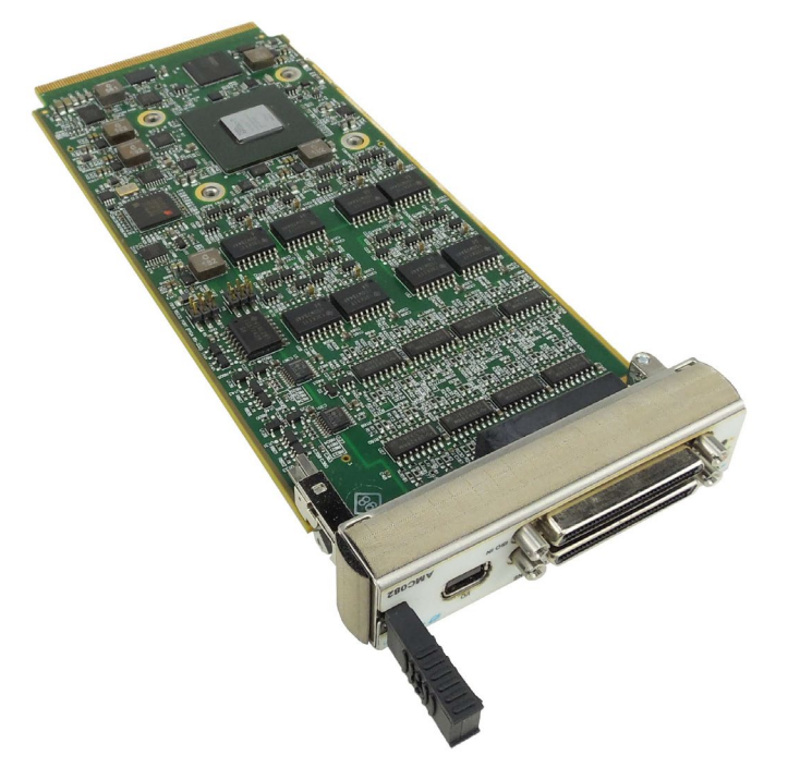
Figure 1: AMC082

The AMC082 is available in both air-cooled (MTCA.0 and MTCA.1) and rugged conduction-cooled versions (MTCA.2 or MTCA.3), please contact sales for details.