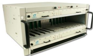
VT866 5U Chassis Platform