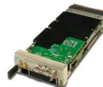
UTC004 MicroTCA Carrier Hub (MCH)