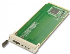
UTC008 JTAG Switch Module (JSM)