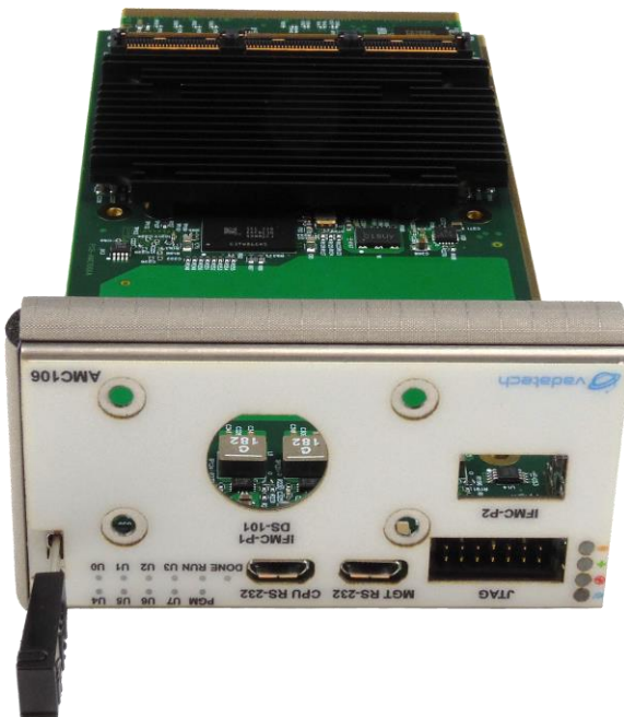
Figure 2: AMC106 Front View