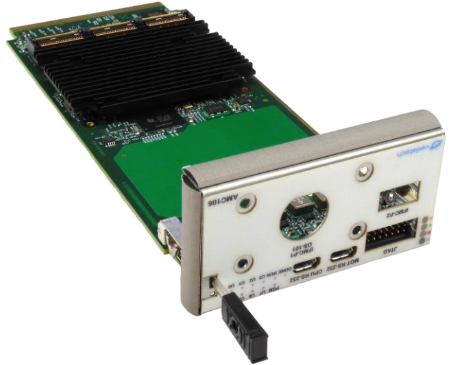
Figure 1: AMC106

The AMC106 interfaces to the backplane via dual GbE as well as x4 SERDES which could be configured to run with any protocol (GbE, 10GbE, SRIO, PCIe, Aurora, etc.). Ports 4-5 and 7-8 are routed to the x4 SERDES. The FPGA has a single hard core PCIe which could be instantiated on the Ports 4-5 and/or Ports 7-8.