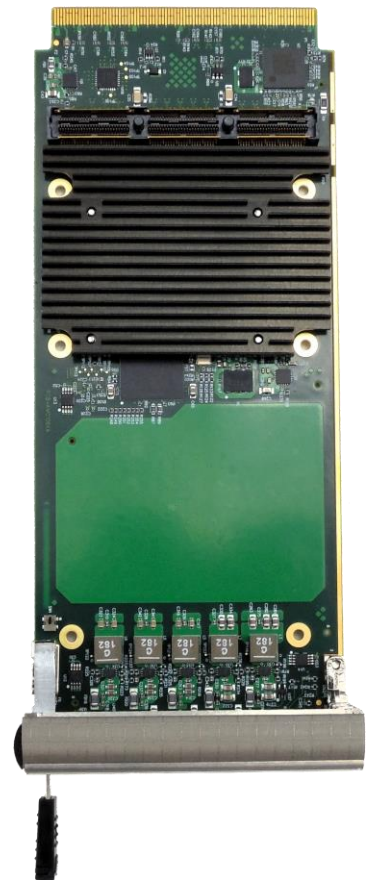
Figure 3: AMC106 Top View