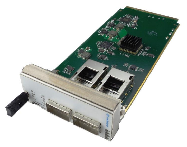
Figure 1: AMC240

See Solution Brief for an overview of a 56 GSPS digitizer with IRIGB/GPS timestamping.