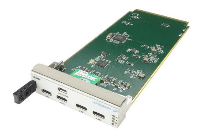
Figure 1: AMC313 Front View

The AMC313 is a single module, mid-size (full-size option available) Advanced Mezzanine Card (AMC) USB 3.0 Adapter based on the AMC.1 specification. The module provides four USB 3.0 ports to the front panel via type-C connectors.