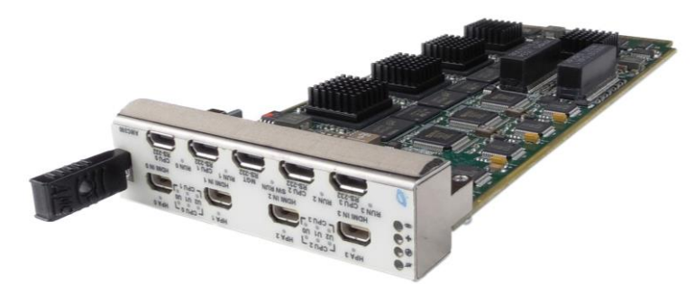
Figure 1: AMC350

See <u>Super Carrier</u> for high-density processing platforms compatible with this product.