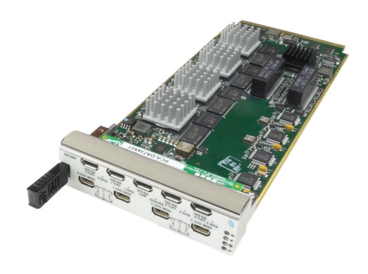
Figure 1: AMC352

See <u>Super Carrier</u> for high-density processing platforms compatible with this product.