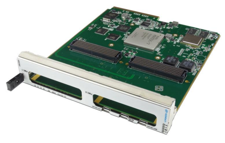
Figure 1: AMC502

AMC502 has an onboard crystal-referenced clock source to provide at least 125 MHz as GTX reference inputs for PCIe, SRIO and GbE. The iMX6 CPU is a quad core ARM processor at 1 GHz for power-efficient distributed processing.