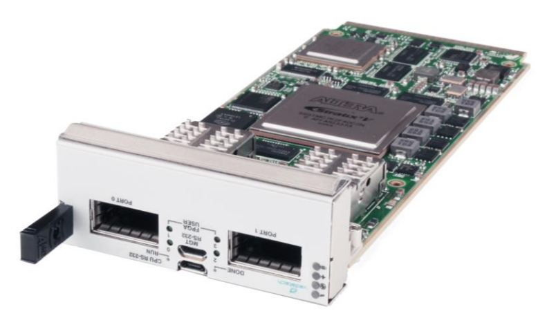
Figure 1: AMC534

See <u>Intel FPGA Solutions</u> for the advantages of using VadaTech products during application development.