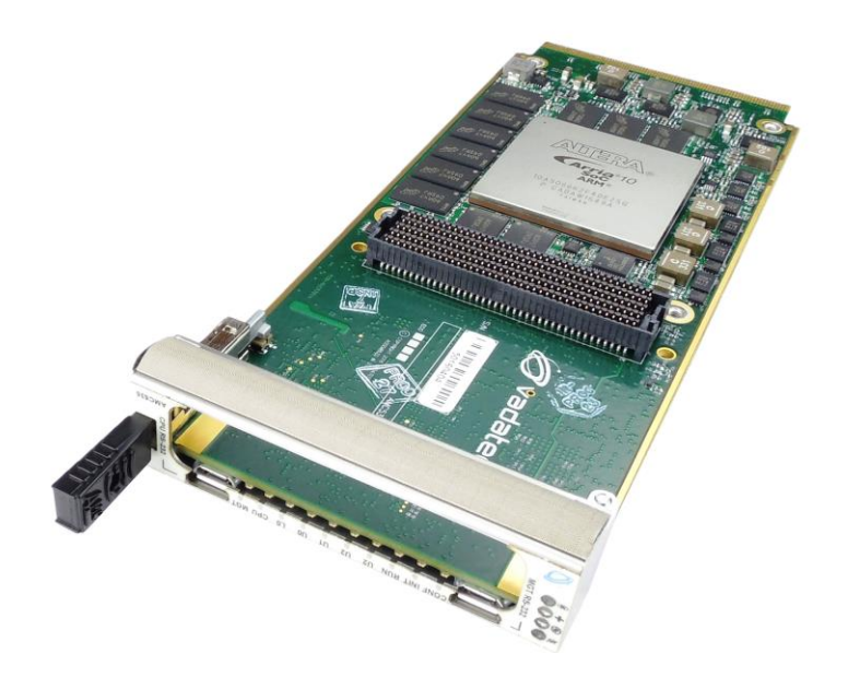
Figure 1: AMC535

See <u>Intel FPGA Solutions</u> for the advantages of using VadaTech products during application development.