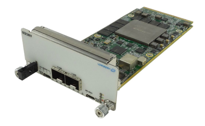
Figure 1: AMC539

The fabric is implemented to support dual x4 PCIe.