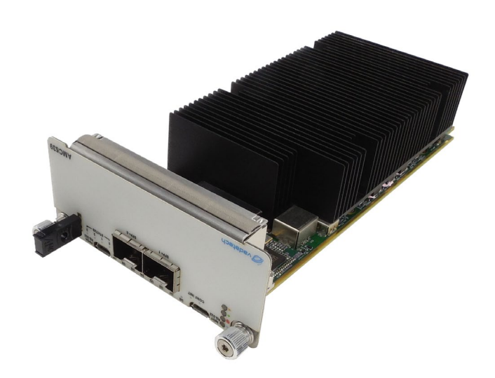
Figure 2: AMC539 w/ Heatsink