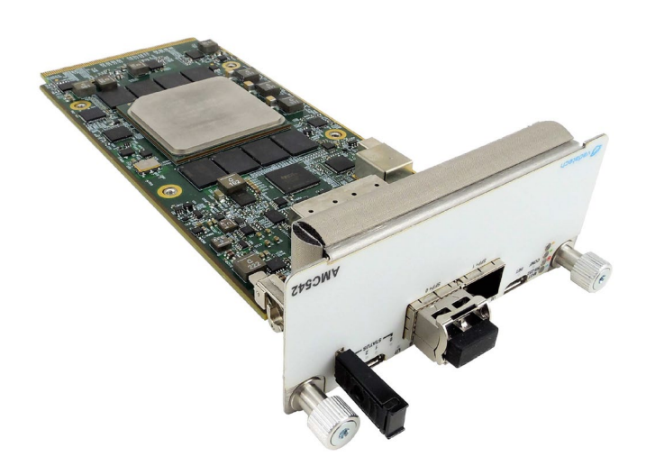
Figure 1: AMC542

The fabric is implemented to support dual x4 PCIe.