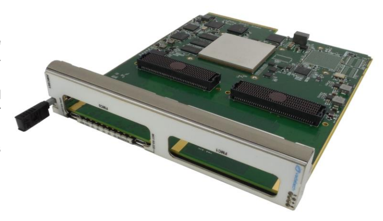
Figure 1: AMC561

The AMC561 has Serial over LAN (SOL) per IPMI specification. It has a hardware RNG for secure session.