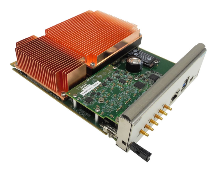
Figure 1: AMC585

The backplane dual GbE link (AMC.2) can be routed either to the FPGA or to the NVIDIA GbE via onboard MUX.